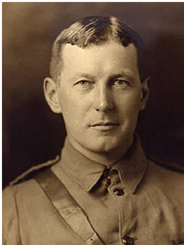
John McCrae in uniform, circa 1914.